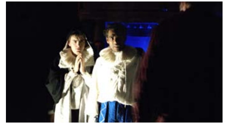
The Life & Deaths of Don Koyote

The CreateAbility Drama Group have welcomed Old Van Theatre Co. to our workshops. Their stage fighting workshops were particularly popular. The group performed the “Pantomime of Death” in Old Van’s show “The Life and Deaths of Don Koyote”.